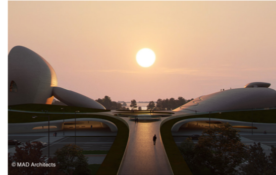
Exhibit Highlights 展品精選

2000 年，早野洋介獲得早稻田大學材料工程學本科學位，2001 年獲得早稻田大學建築研學院的聯合本科學位，2003 年獲得倫敦建築學院碩士學位。他曾獲得過 2006 年紐約聯盟青年建築師獎，2011 年的亞洲設計獎以及熊本藝術建築獎。2008 年至 2012 年，他曾擔任早稻田藝術大學客座講師，2010 年至 2012 年東京大學任客座講師。自 2015 年至 2019 年，早野洋介曾擔任倫敦建築學院的評審導師。