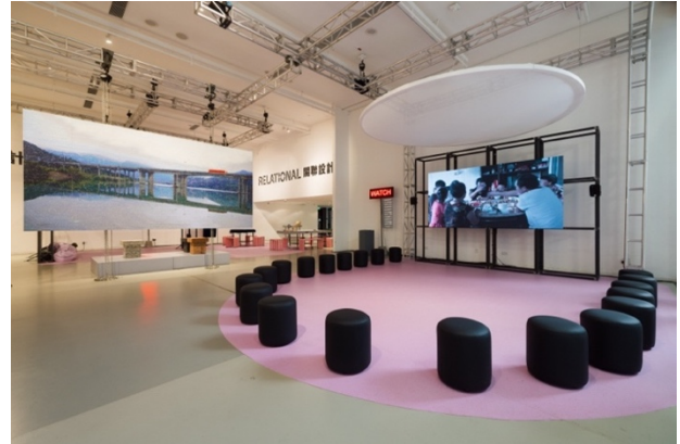
"ITALY: A New Collective Landscape" exhibition view

The configuration of the exhibition highlights congruences with respect to three design virtues – systemic, relational and regenerative - operating under the assumption this landscape could be reconfigured in a myriad of new readings and associations. The exhibition features a wide variety of design objects, from furniture, apps, clothing, prints, and more.