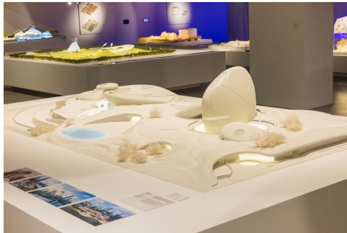
“Shenzhen Bay Culture Park”, Shenzhen, China (2018 – 2025)

Before audiences are greeted by this impressive installation, they are first invited to delve into the pieces it references. Attendees can explore the breadth of MAD's projects across the globe, beginning at the closest – the soon to be finished Shenzhen Bay Culture Park. Located in the Nanshan District of Shenzhen, the park aims to create “a buffer and breathing zone” for people in the busy metropolis. With the key concept of “ancient future”, MAD's design places a surreal scene of land art into a real urban space. Viewers can explore the parts “monumental stones” of white granite that curve in a natural form, injecting the organic into the constructed.