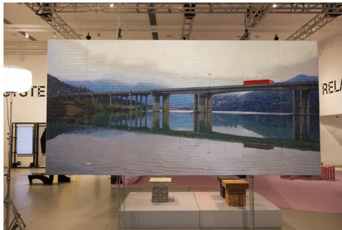
"Diamond Model", Martina Muzi, Tapestry

Relational Design can be understood as both a social practice and a tool to cultivate community and interconnection among human and non-human actors. With this in mind, the exhibition design features distinct zones catering to interaction (Play), research (Read) and entertainment (Watch). Rather than solely focusing on individual enjoyment of content, the areas are intended to realise the collective experience by actively involving the public. This transforms the space into an inclusive and dynamic whole that moves beyond conventional exhibitions. Through its emphasis on connection and participation across sectors, the design aims to establish the exhibition as an overall landscape welcoming all.