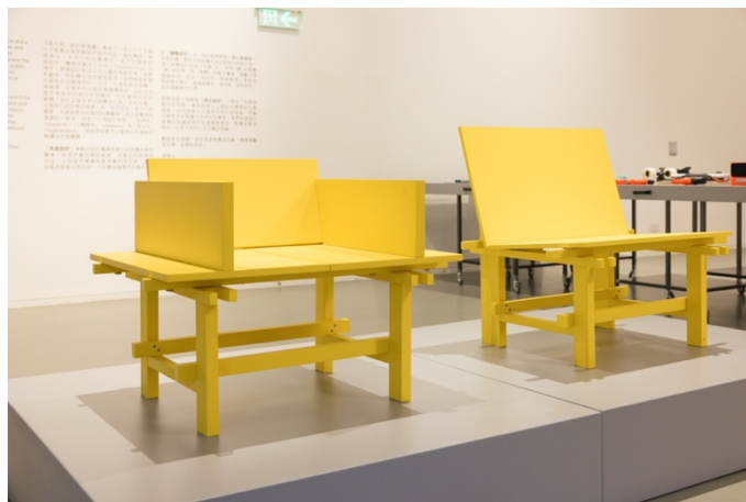
"MAX +1,5° Celsius", Atelier Ferraro, Convertible furniture

Systemic Design examines the network of interconnections a project establishes in order to achieve its objectives. This includes relationships for acquiring necessary resources, generating outcomes and outputs, and fostering inclusive, sustainable and circular processes. Particular attention is paid to interactions within the supply chain and how resources are utilised, with the goal of promoting development models that create positive system-wide impacts.