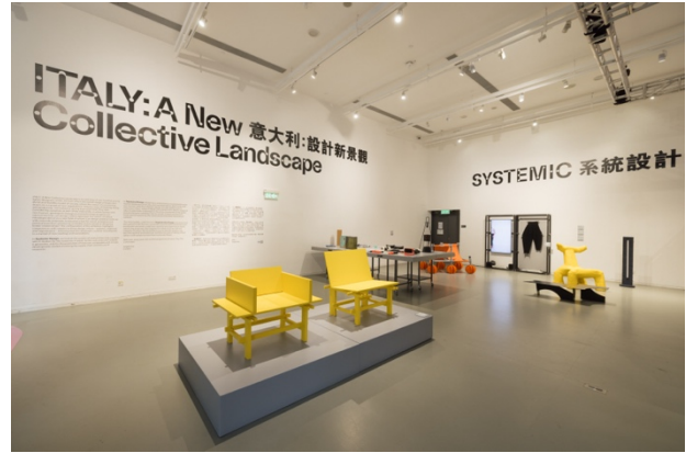
“ITALY: A New Collective Landscape” exhibition view

(Hong Kong, 19 January 2024) Hong Kong Design Institute (HKDI) and its affiliate HKDI Gallery is delighted to present its flagship design exhibitions for 2024. Dual exhibitions “Ma Yansong: Landscapes in Motion” and “ITALY: A New Collective Landscape” are curated to foster multi-disciplinary design appreciation among the public. Both exhibitions will run from 19 January 2024 at the HKDI gallery.