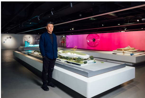
Mr Ma Yansong, Founder and Principal Partner of MAD

Adapted from the Shenzhen Museum of Contemporary Art and Urban Planning’s large-scale solo exhibition that ran in 2023, “Ma Yansong: Landscapes in Motion” has been exclusively curated for the HKDI Gallery by its founder, and principal partner of MAD Architects (MAD) - an architectural collective, MA Yansong. After graduating from Yale University in 2002, MA has participated in various international exhibitions and is now set to debut his first-ever large-scale solo exhibition in Hong Kong, solidifying his status as one of China’s most influential architects. The exhibition presents MAD’s most significant urban architectural projects in history led by MA Yansong, in addition to the artist’s thought-provoking design concepts and imaginative vision. This exhibition offers a glimpse into the future of urban civilization – proffering a harmonious coexistence of urban landscapes, historical sites, and natural environments.