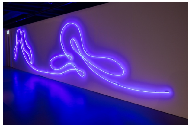
“Landscapes in Motion”, MA Yansong, Neon art installation

The first floor of the exhibition focuses on the major projects of MA Yansong and the MAD team, including a series of large-scale models and the brand new interactive installation which is exclusively designed for HKDI. The neon art installation on the same floor “Landscape in Motion” trace MA’s original hand-drawn design concept sketches of the projects highlighted in the exhibition, including UNIC Harbin Opera House, Shenzhen Bay Culture Park, Quzhou Sports Park, and the FENIX Museum of Migration, the piece fills the exhibition hall. Bridging the past and future, MA employs the aesthetics of Hong Kong’s neon heritage to