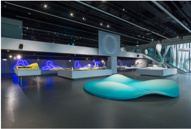
“Ma Yansong: Landscapes in Motion” exhibition view