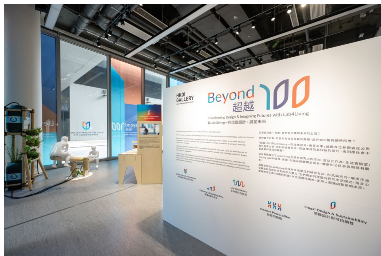
“Beyond 100: Transforming Design & Imagining Futures with Lab4Living” will launch on 12 November 2022

The first Hong Kong exhibition of renowned design-led research group Lab4Living explores an equal world created by design, where humans can live to be more than 100 years old.