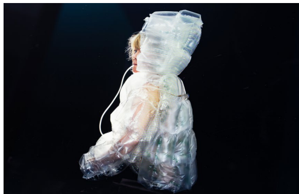
“HUG” offers a conceptual response to issues around loneliness and the lack of human interaction during the COVID-19 pandemic.

Visitors can explore the eclectic approaches, formats and directions undertaken by Lab4Living through five themes. The artefacts demonstrate the power and potential of design to transform lives, foster positive change and support human flourishing. The exhibition also exemplifies creative ways in which designers have responded and adapted to changing circumstances during the COVID-19 pandemic.