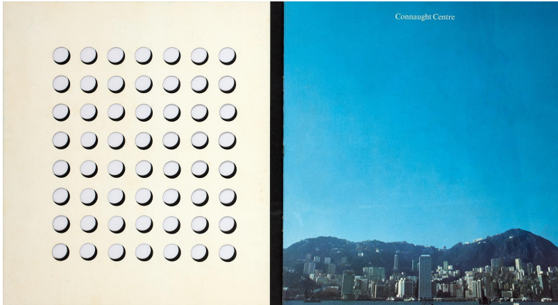
Hongkong Land, Connaught Centre Brochure in 1973