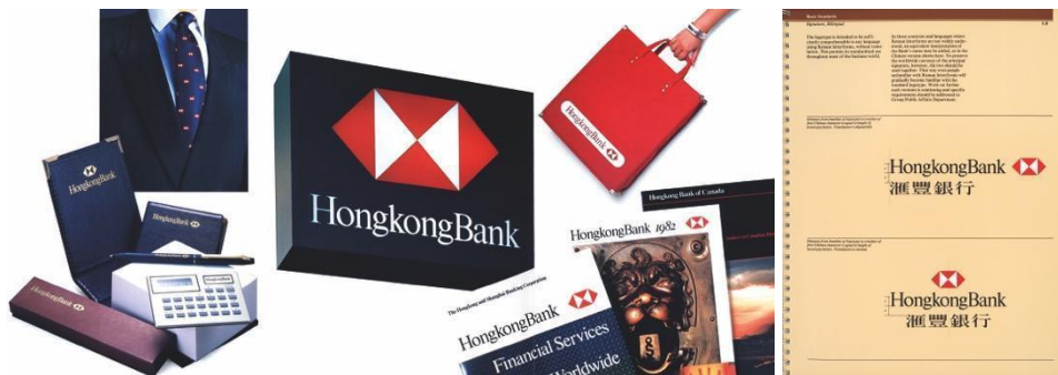
HSBC, Visual Identity System 1983-84 (Steiner made use of a hexagon to present HSBC's brand identity as modern and international. Its bright identity system gives it a sharp presence in the finance industry.) Image courtesy of Steiner & Co.