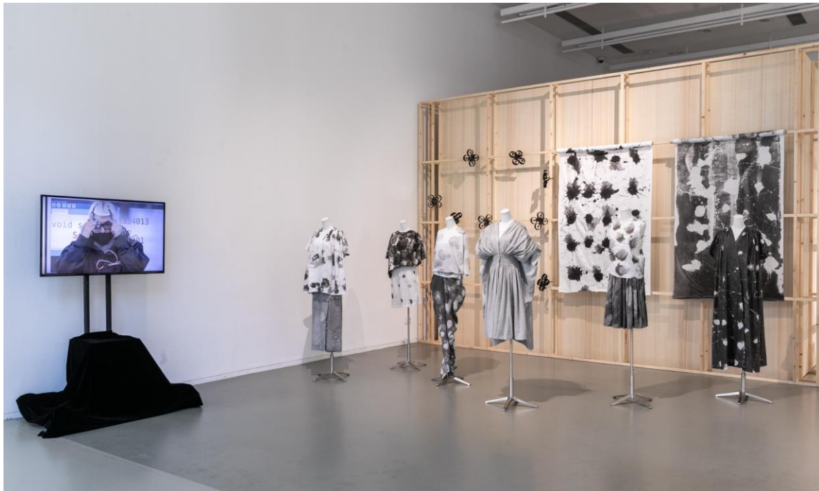
Adopting ongoing experiments with technology, Fujiwara operated drones by a head gear to create the namesake "Cyber Physical Hands" garment collection for the exhibition.

As a continuation, the second area introduces a series of installations and projects that focus on Fujiwara's unique design methods and perspectives. Inspired by his personal research and investigations, Fujiwara devised the "colour-hunting" concept, where colours in real life were reproduced with watercolour mixed onto pieces of paper. Presenting new design possibilities based on these "real colour" swatches from the natural world and our cities, the exhibition showcases Fujiwara's various colour-hunting projects, including his works with an eyewear and a cosmetics brand respectively: "Skin Color Glasses" and "Baby Skin Earphones", in which he created eyeglasses and earphones with colours derived from adults' and babies' skin colours; "Enoshima Electric Railways, Information Train", a moving installation to illustrate how colours hunted from countless leaves in Enoshima came together, and were recreated into a stripe pattern of 17 colours worn by the local tram car; "Lion Shoes" for a footwear brand, with mobile robots mounted onto shoes dyed with colours collected from African lions, resembling lions catching prey in the wild; and "Color of Sky", a collection of different sky colours documented by Fujiwara since 2013.