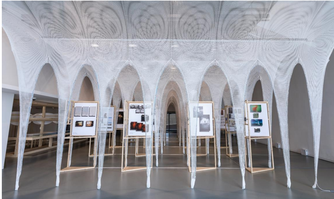
“Dai Fujiwara The Road of My Cyber Physical Hands” is renowned Japanese designer Dai FUJIWARA’s first solo exhibition in Hong Kong.