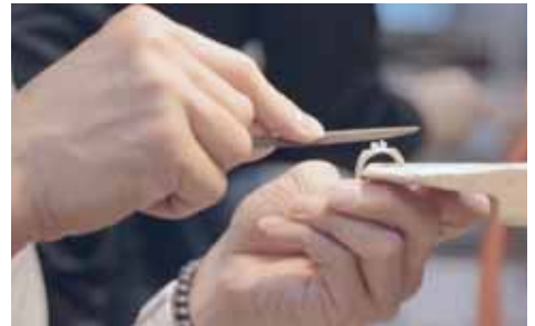
Hand-made jewellery by learners