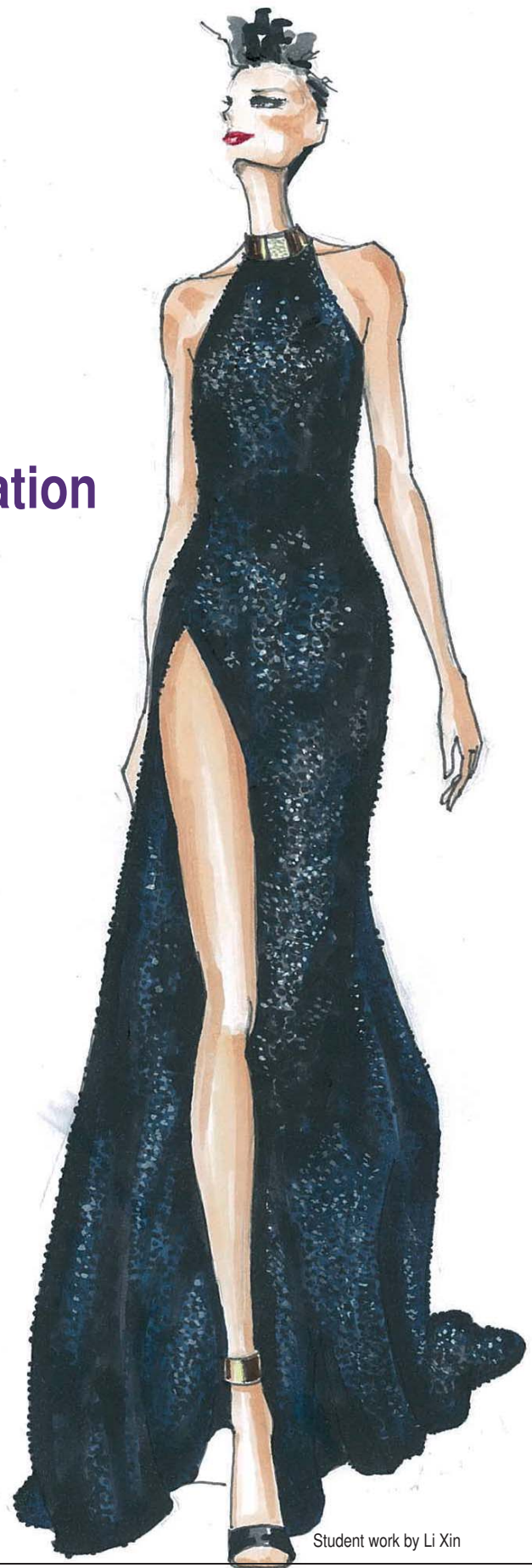
Student work by Li Xin