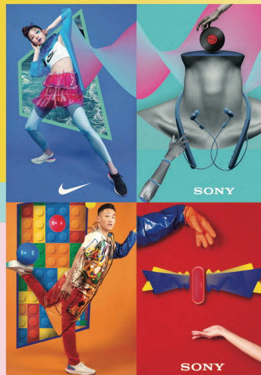
#Collaborative project with Sony & Nike